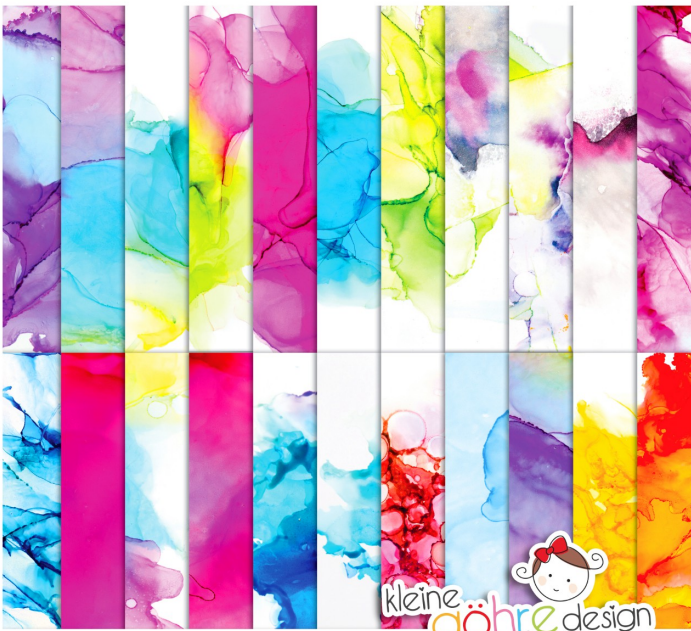
digitale Papiere "Farbexplosion zarter Muster3"