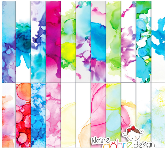
digitale Papiere "Farbexplosion zarter Muster4"